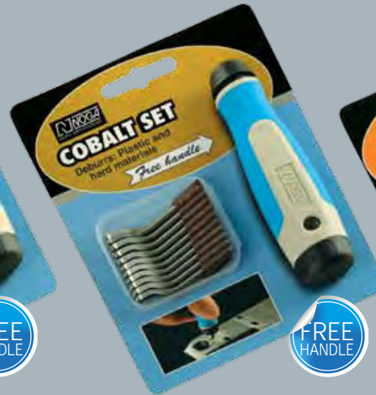
Cobalt Set NG8250 INCLUDES: NogaGrip-1- handle - NG1000 20 pcs. S100 blades - BS1018