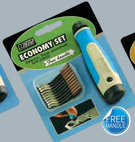
Economy Set NG8200 INCLUDES: NogaGrip-1- handle - NG1000 20 pcs. S10 blades - BS1010