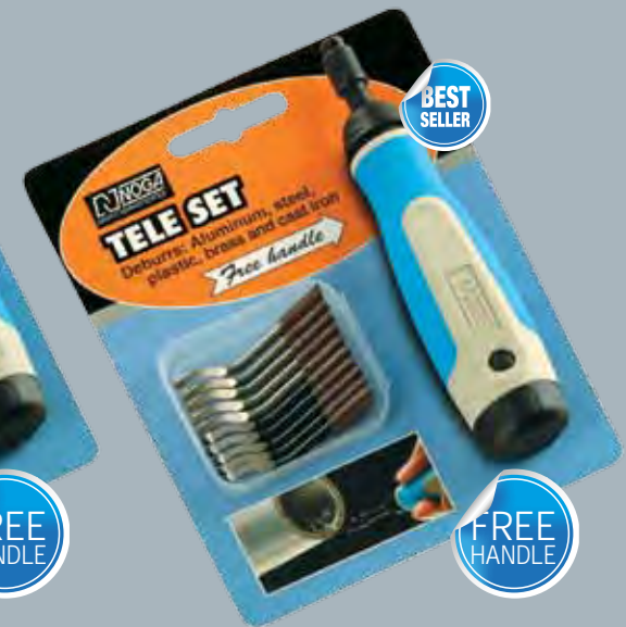
Tele Set NG8350 INCLUDES: NogaGrip-3- handle - NG3000 S Holder EL02003 5 pcs. S10 blades - BS1010 5 pcs. S20 blades - BS2010