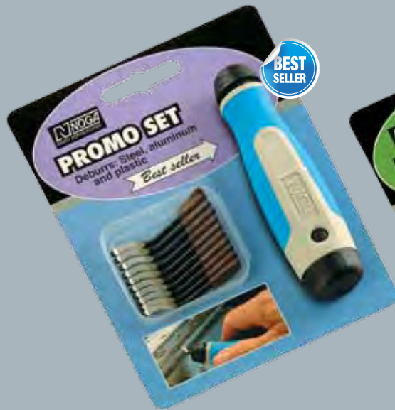
Promo Set NG8150 INCLUDES: NogaGrip-1- handle - NG1000 10 pcs. S10 blades - BS1010